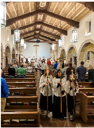
Our acolytes leading the procession out of a fantastic Choral Evensong service.